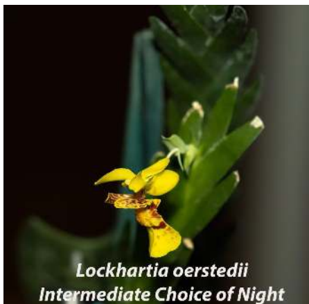
Lockhartia oerstedii Intermediate Choice of Night