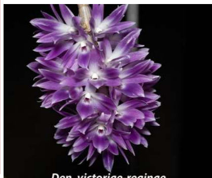
Den. victorica reginae