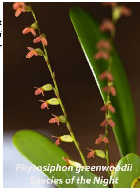
Physoisiphon greenwoodii Species of the Night