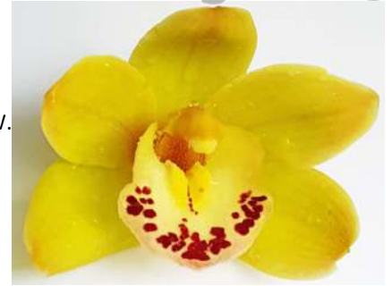
Cymbidium Shoalhaven 'Touch of Class'