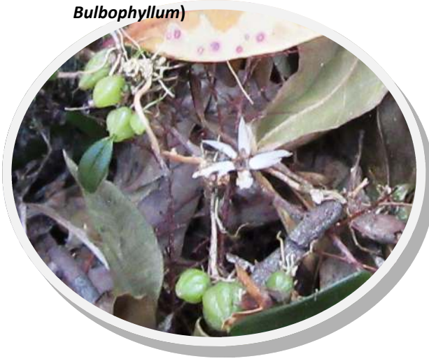
Adelopetalum exiguum (was Bulbophyllum )