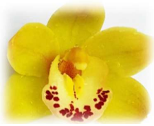
Cymbidium Shoalhaven 'Touch of Class'