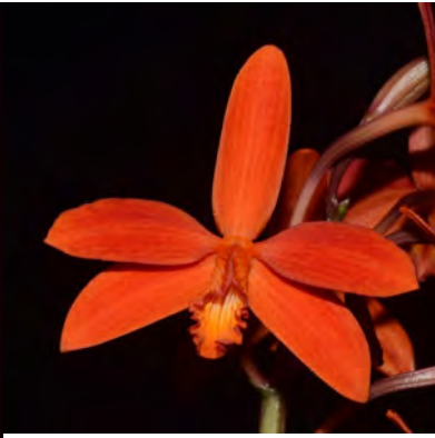
Laelia milleri - Best Species - L. Phelan