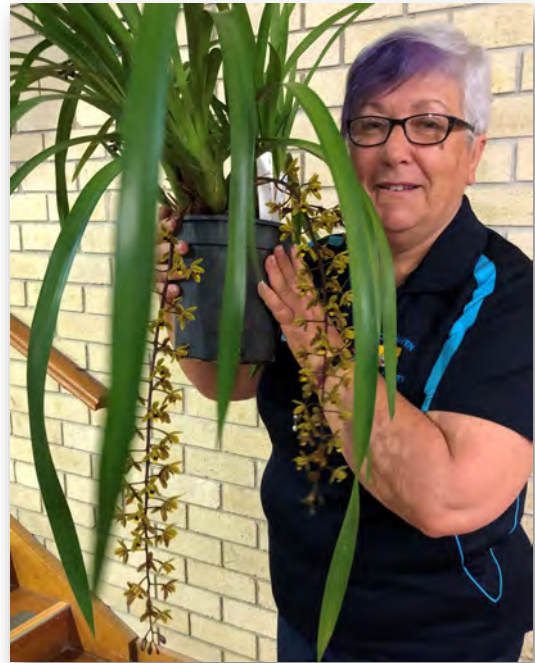
Novice Popular Vote - Cym. Kuranda 'Arthur Dawson'