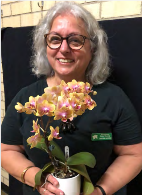
Novice Popular Vote - Phal. Unknown