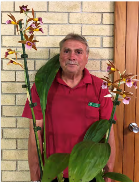
Intermediate Popular Vote - Phaius tankervilleae