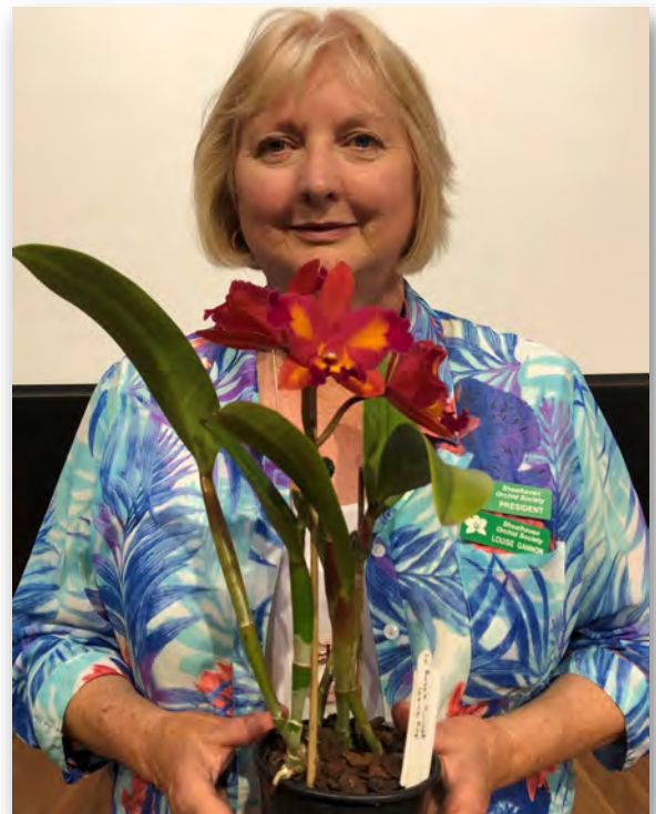
Open Popular Vote - Lc Australian Sunset 'Cosmic Fire'