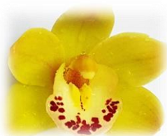
Cymbidium Shoalhaven 'Touch of Class'