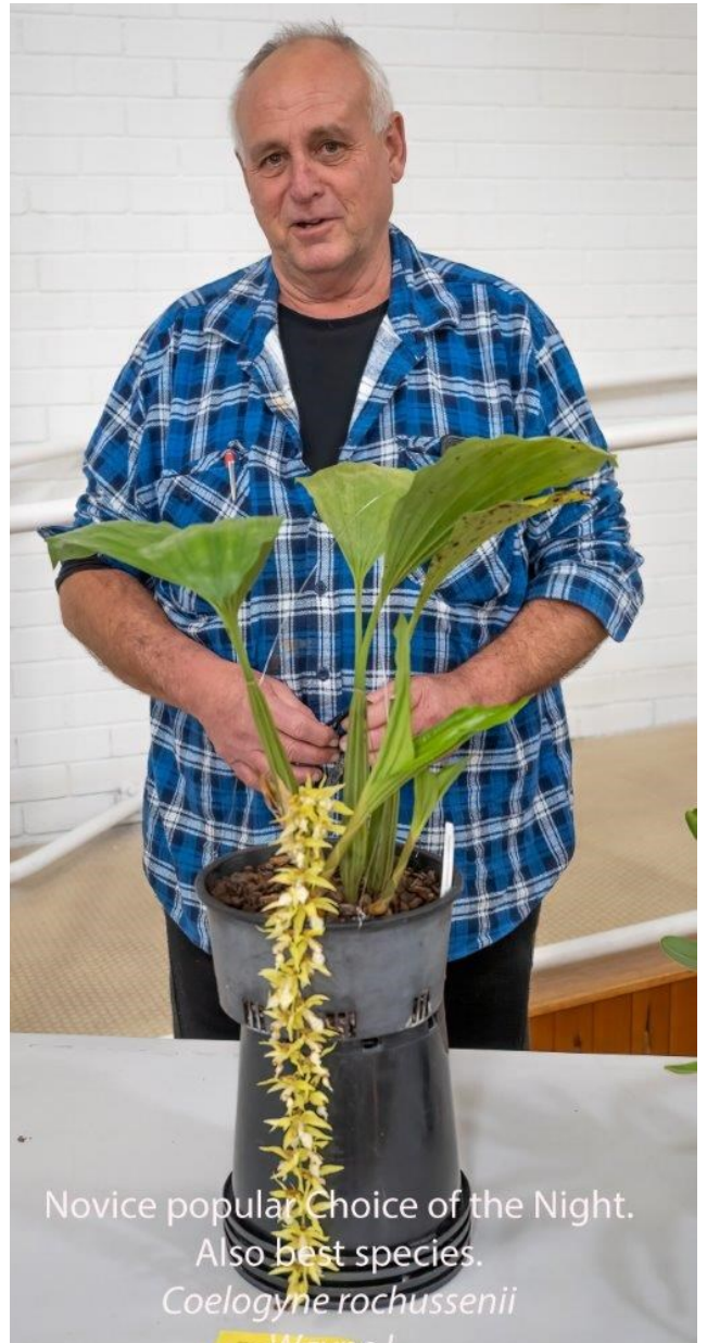
Novice popular Choice of the Night. Also best species. Coelogyne rochussenii