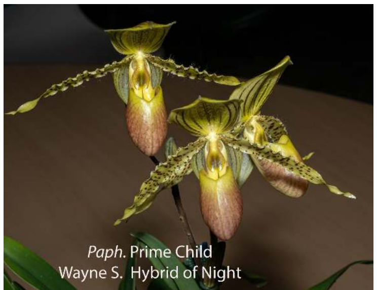
Paph. Prime Child Wayne S. Hybrid of Night