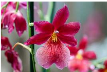
Typical Miltonia flower shape

Miltonias tend to be easier to grow and flower as the Miltoniopsis come from the cloud forests and cannot tolerate very hot conditions.