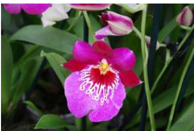
Typical Miltoniopsis 'pansy' flower shape

The Society thanks our generous Sponsors We encourage you to support them.