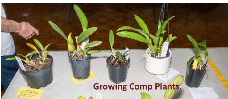
Growing Comp Plants.