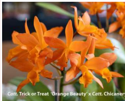
Catt. Trick or Treat 'Orange Beauty' x Catt. Chicanery