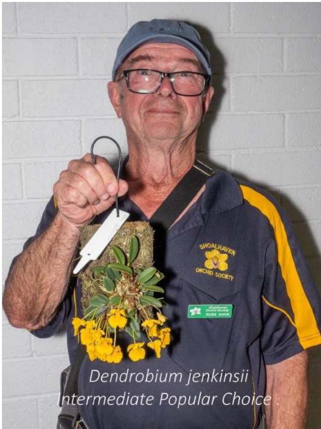
Dendrobium jenkinsii Intermediate Popular Choice