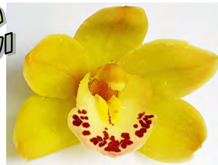
Cymbidium Shoalhaven 'Touch of Class'