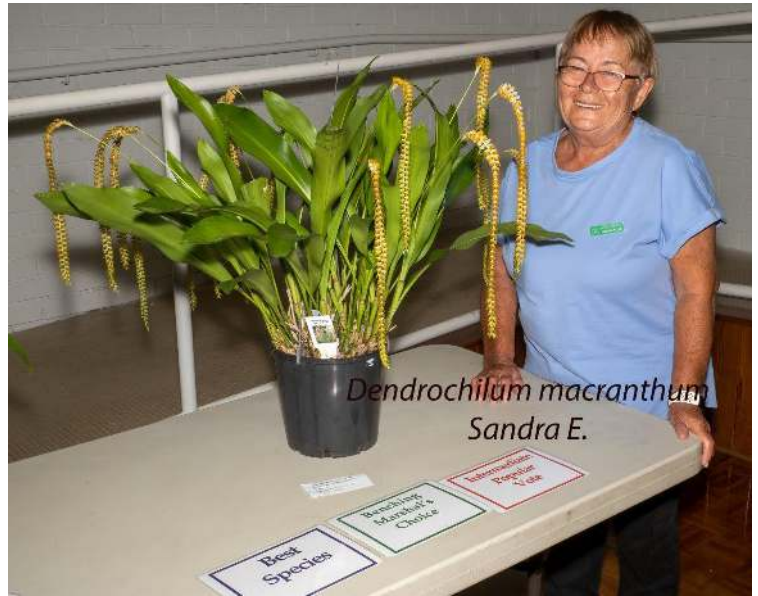
Dendrochilum macranthum Sandra E.