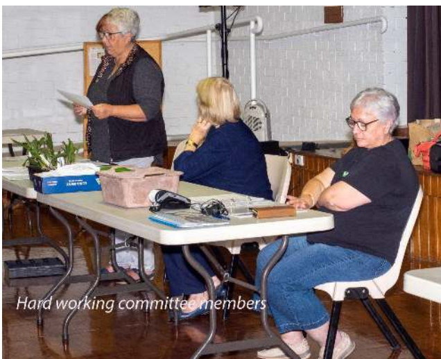
Our Executive team.

POTS FOR SALE Pots in various sizes have been donated to the society. These are now reasonably priced on the sales table.