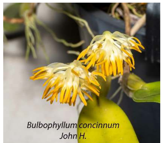
Bulbophyllum concinnum