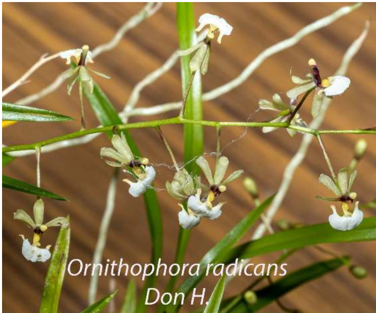
Ornithophora radicans Don H.