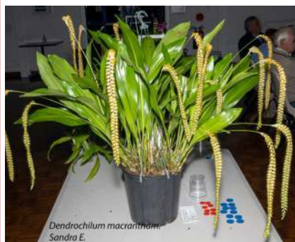
Dendrochilum macranthum Sandra E.