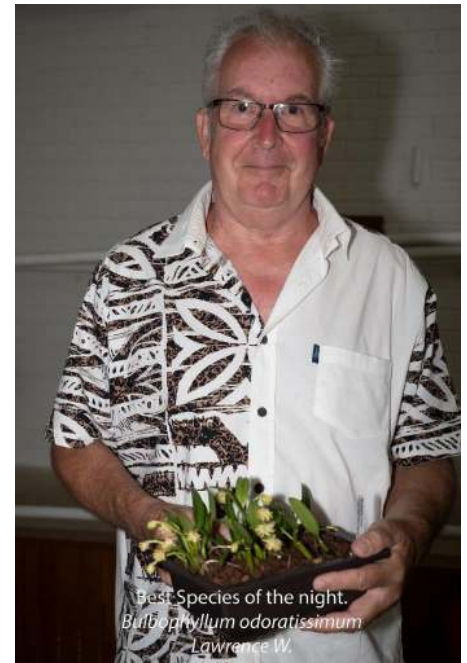
Best Species of the night. Bulbophyllum odoratissimum Lawrence W.