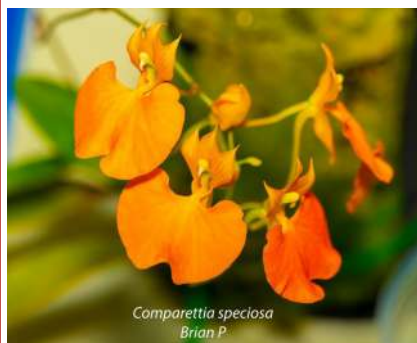
Comporettia speciosa

CHARITY AUCTION - We do not have a guest speaker this month as it is our auction of orchids and orchid-related paraphernalia to raise money for a local charity that helps support less fortunate members of our community. This year our recipient will be SALT Ministries who look after homeless people. Members are invited to donate any spare orchids or any orchid growing materials. There will be no plant sales on the sales table but the usual orchid accessories will be available.