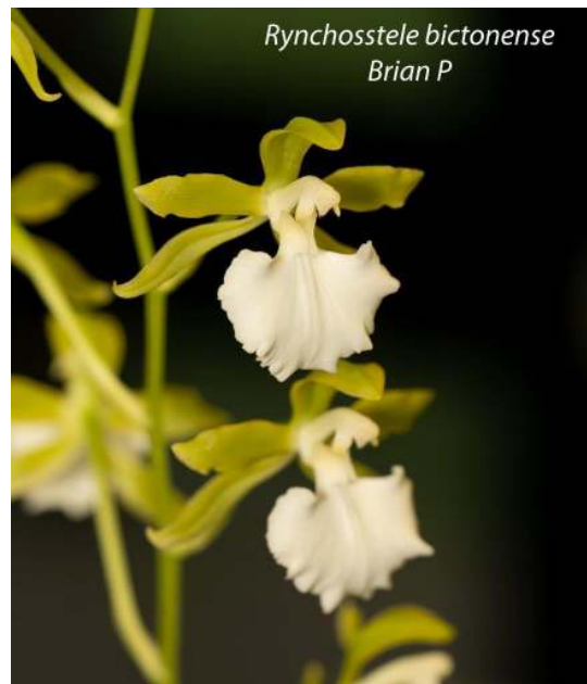
Rynchosstele bictonense Brian P