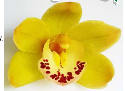
Cymbidium Shoalhaven 'Touch of Class'