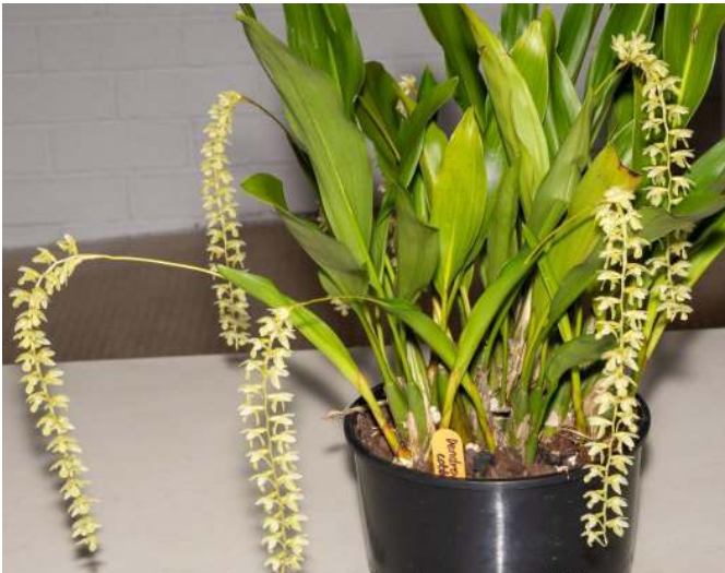
For example: Dendrochilum cobbianum becomes Coelogyne cobbiana

Based on DNA analysis, scientists at Kew and elsewhere have determined that the following genera should be transferred into the genus Coelogyne: Bracisepalum, Bulleyia, Chelonistele, Dendrochilum, Dickasonia, Entomophobia, Geesinkorchis, Gynoglottis, Ischnogyne, Nabalua, Neogyna, Otochilus, Panisea and Pholidota. (Refer: https://www.biotaxa.org/Phytotaxa/article/view/phytotaxa.510.2.1 .)