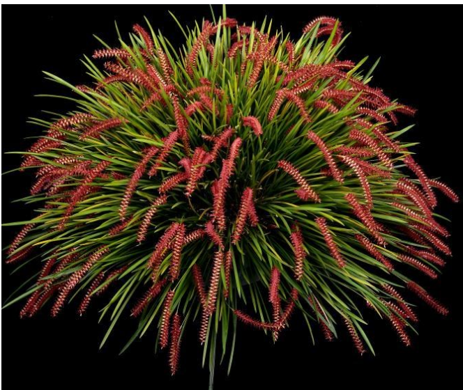
Dendrochilum wenzelii becomes Coelogyne wenzelii

If you have any dendrochilums or any of the other genera named you should consider changing their labels or including the new name; e.g. Coelogyne (ex Dendrochilum ) wenzelii .