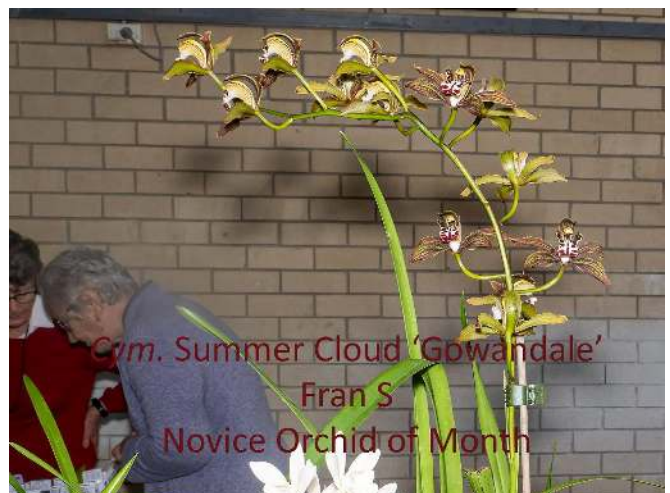
Cym. Summer Cloud 'Gowandale' Fran S Novice Orchid of Month