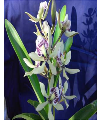
Encyclia cochleata ( outcross)

Lawrie Cowell has these two orchids in flower. Though they are both labelled Encyclia cochleata (now Prosthechea cochleata ) they are quite different. The left one is certainly P. cochleata but perhaps someone can identify the one on the right.