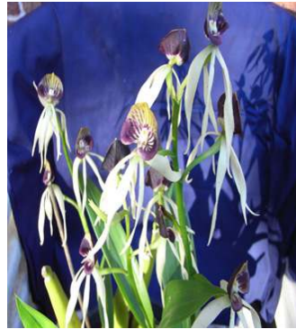
Encyclia cochleata 'Tinonee' X Encyclia cochleata var Alba