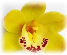
Cymbidium Shoalhaven 'Touch of Class'