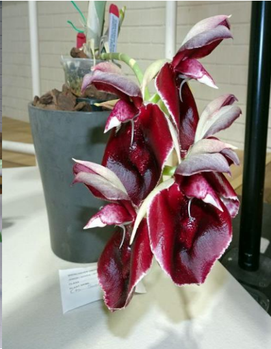
Open Popular Vote