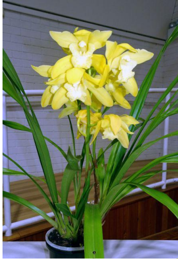
Novice Popular Vote