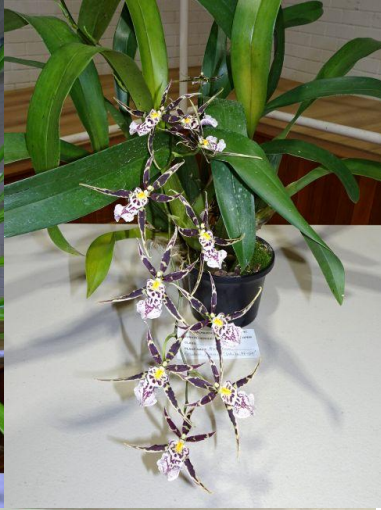
Intermediate Popular Vote