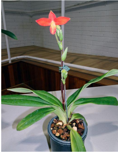
Open Popular Vote