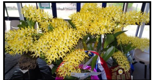
Ron Findlater's Champion Native