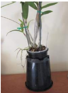
How I like to be shown!!