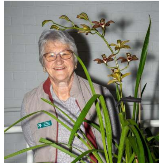
Novive Popular Vote Cym. erythraeum x Death Wish F. Sheil