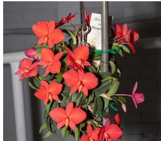
Open Popular Vote Catt. brevipedunculata B. Phelan