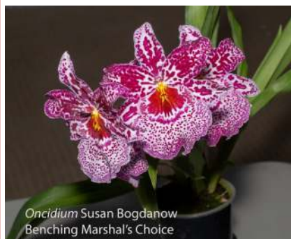
Oncidium Susan Bogdanow Benching Marshal's Choice