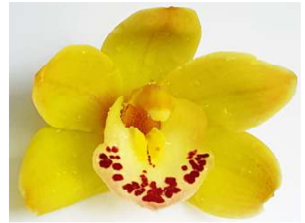
Cymbidium Shoalhaven 'Touch of Class'