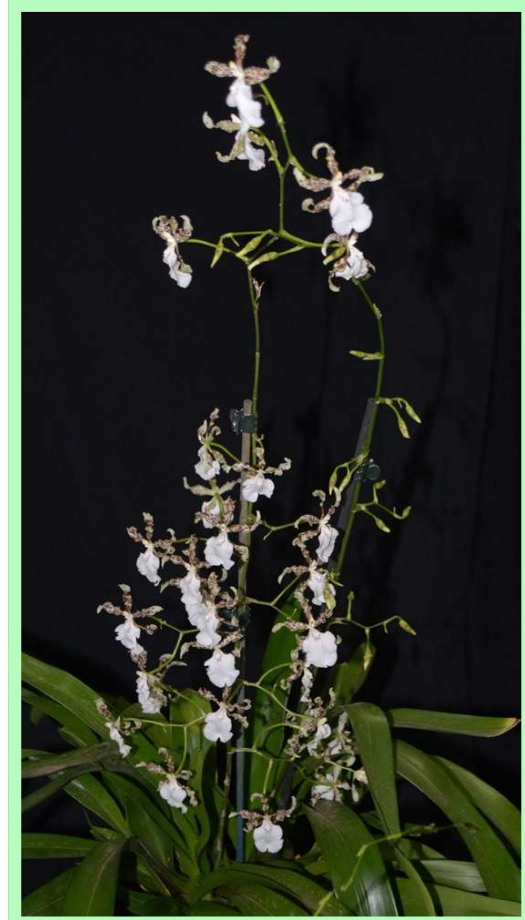
Onc. Speckled Spire

Intermediate Popular Vote and Orchid Hybrid of the Night