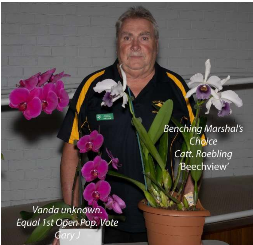
Benching Marshal's Choice Catt. Roebling 'Beechview'