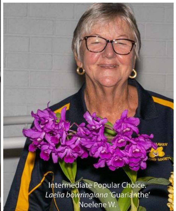
Intermediate Popular Choice. Laelia bowringiana 'Guarianthe' Noelene W.