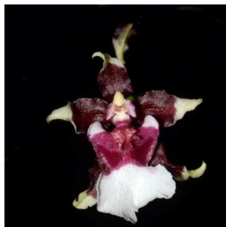
Oncidium - Heaven Scent 'Redolence' F. Sikora