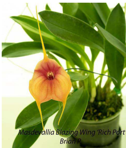
Masdevallia Blazing Wing 'Rich Port' Brian P.