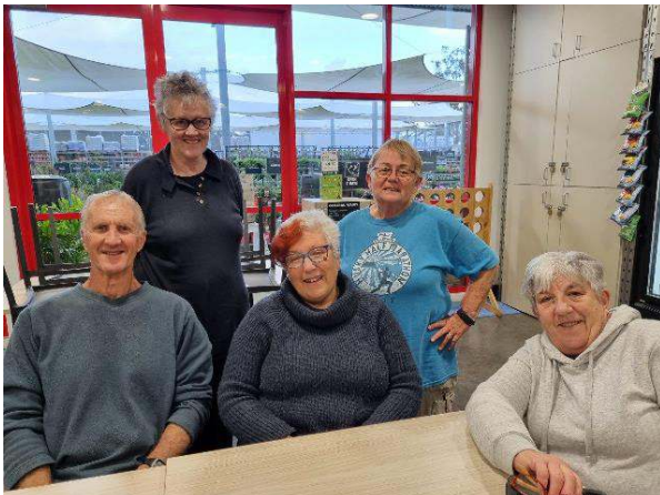
Some of the workers who sizzled sausages, etc. on Saturday 27 August.