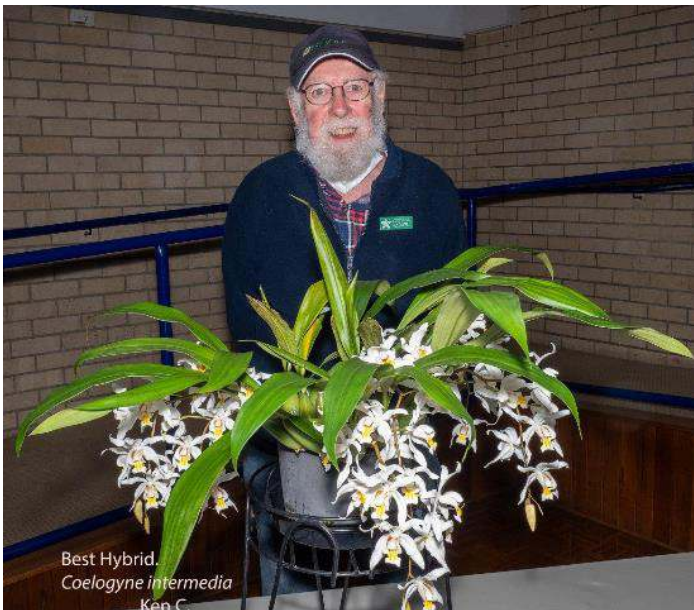
Orchid Hybrid of the Night Coelogyne Intermedia Ken Coates