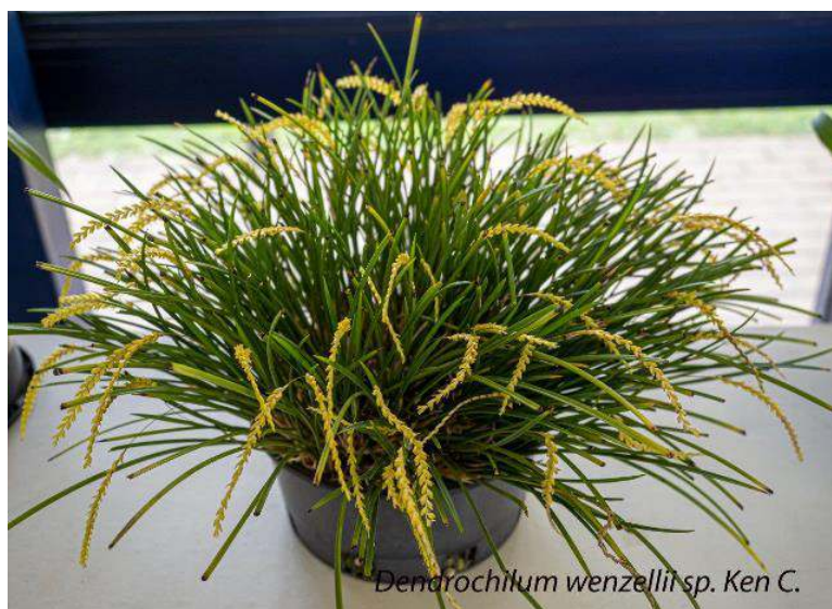
Dendrochilum wenzellii sp. Ken C.