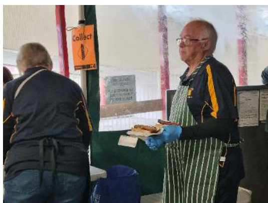
Many thanks to all the members who worked on the Bunnings barbeque or promotions table to raise funds for the society and promote our Spring show. A great team effort.