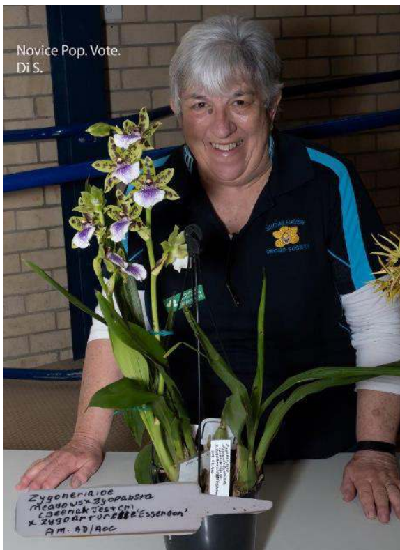
Novice Orchid of the Night Zygo. Adelaide Meadows x Z. Beenak Jester x Z. Artur Elle Di Slye