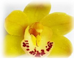
Cymbidium Shoalhaven 'Touch of Class'