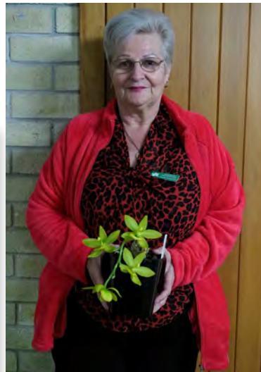
Orchid Hybrid of the Night - Cycnodes Super Swan H. Douglass