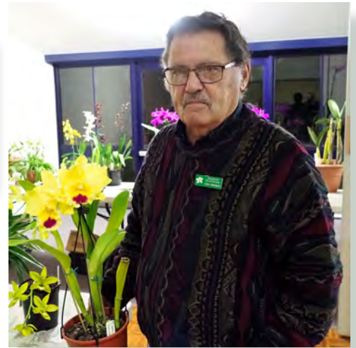
Intermediate Orchid of the Night - Rlc. Golden Zelle J. Harriman