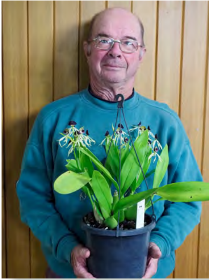
Novice Orchid of the Night - Prosthechea cochleate R. Hahn