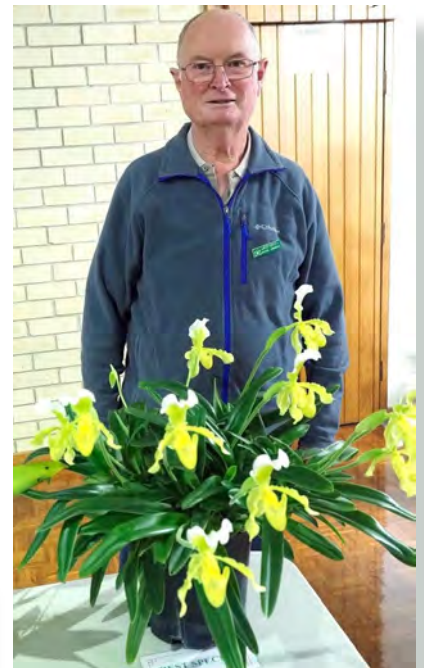
Orchid Species of the Night - Paph. insigne var. Sanderæ W. Simmons