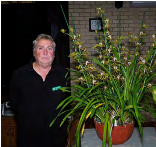
Open Orchid of the Night - Cymbidium tracyanum G. Jonas