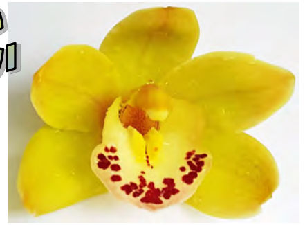
Cymbidium Shoalhaven 'Touch of Class'