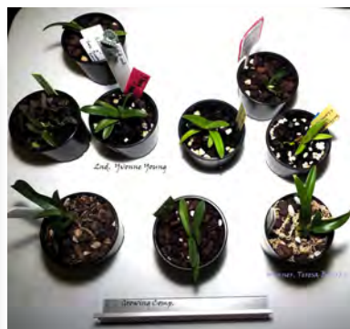
Growing Comp. Plants