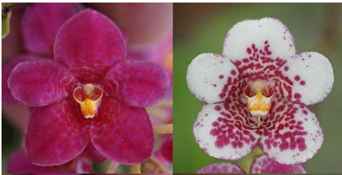
Sarc. Elegance 'Super' x S. Sweetheart 'Speckles'

These are the 'parents' of the new growing comp. plant to be issued tonight.