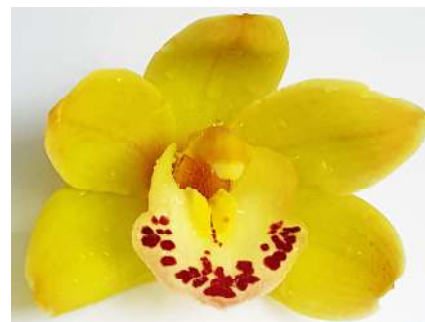
Cymbidium Shoalhaven 'Touch of Class'