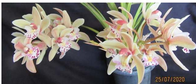
Cym. floribundum alba.

Coach Groups $4pp Children <15 yrs free. Impressive orchid displays, plants for sale, growing advice Contact: Helen Mason 0448 535528