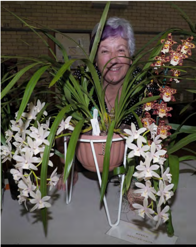
Novice Orchid of the Night: Cym. Unknown and Wils. Eye Candy 'Penny Candy'