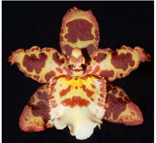
Wilsonara Eye Candy 'Penny Candy'