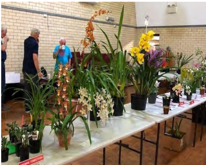
The beautiful array of orchids benched at our September meeting