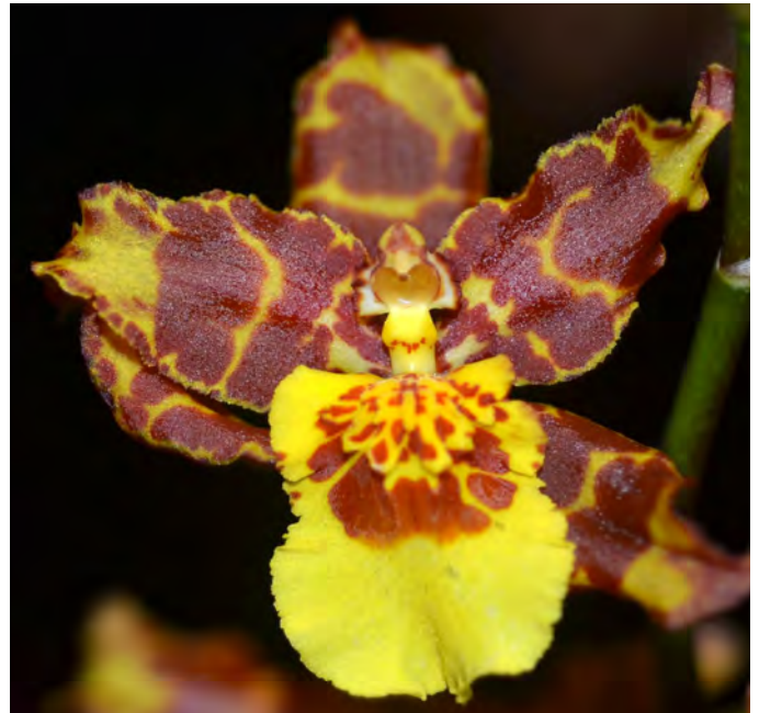
Intermediate Orchid of the Night and Orchid Hybrid of the Night: Wils. Passion Handsome