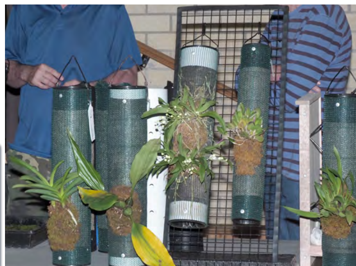
Examples of some of the mounted orchids.