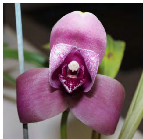
Lycaste Jackpot King