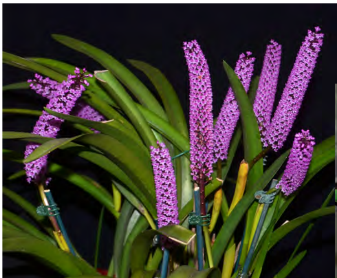
Open Orchid of the Night and Orchid Species of the Night: